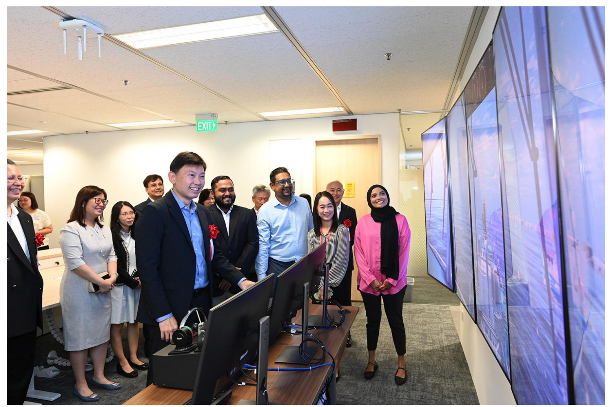
(Guests viewing the vessel's bridge simulator in KMSM office)

KMSM aims to provide high-quality and trusted ship management services and establish a customeroriented support organization rooted in the region, and flexibly respond to diversifying needs. With this, it is KMSM's intention to strengthen our global functional strategy structures of marine technology, organizations, human resources including ship management companies.